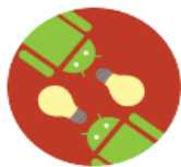
Create a Company