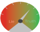
Two Truths & A Lie