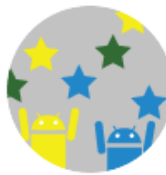
Work Together to Win